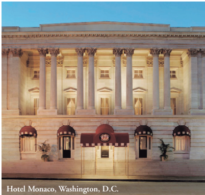
Hotel Monaco, Washington, D.C.

Heritage Consulting Group is based in Portland, Oregon, with a regional office in Philadelphia, Pennsylvania and satellite offices in Washington, DC and San Francisco, California.