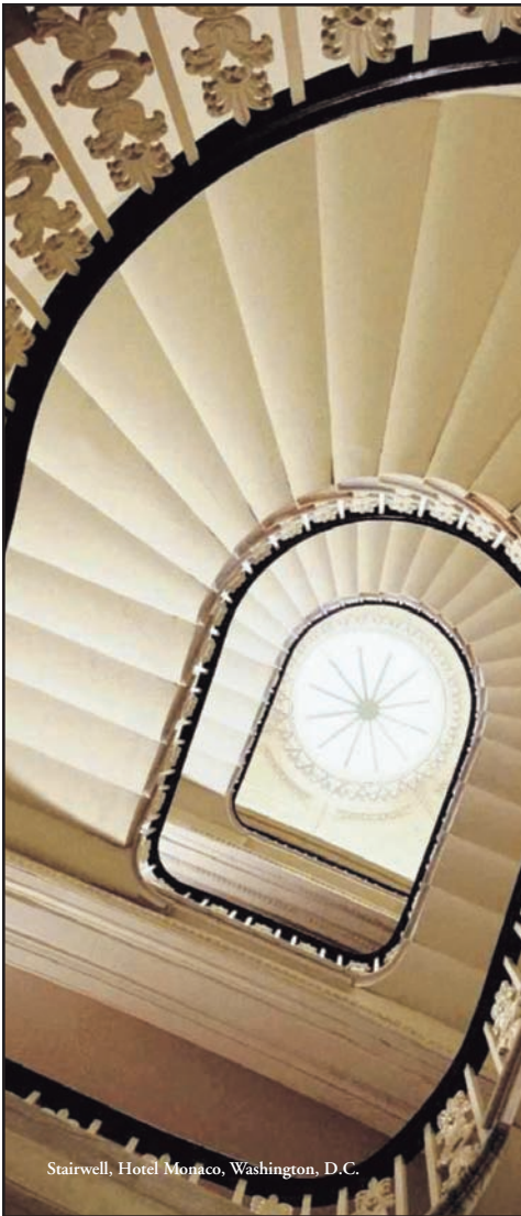
Stairwell, Hotel Monaco, Washington, D.C.