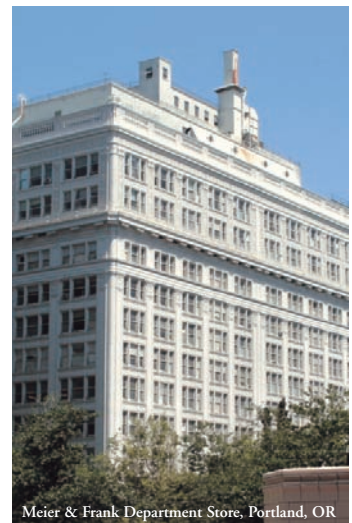
Meier & Frank Department Store, Portland, OR

The National Leader in Historic Rehabilitation and Real Estate Redevelopment Consulting